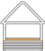
Sub-floor with timber battens